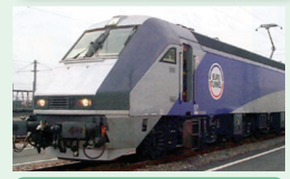
Euro Tunnel locomotives are fitted with Tempest filter